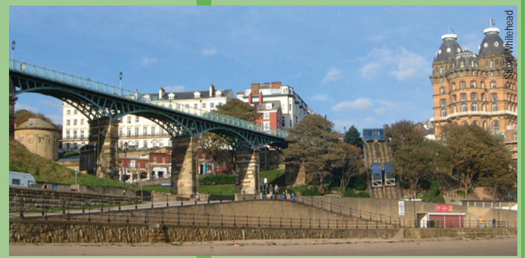
The valley footbridge from the Assembly area.