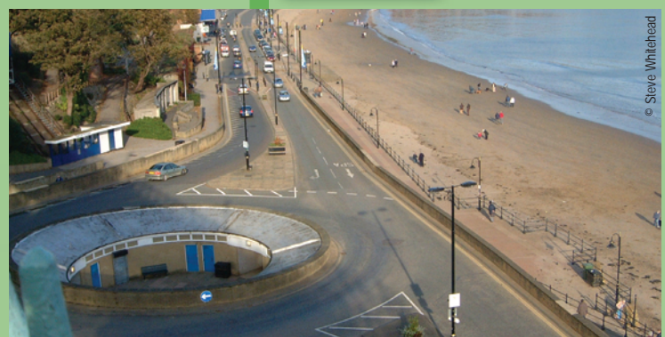
Looking down to the underpasses and assembly from the valley footbridge