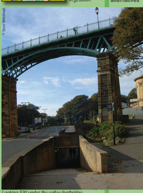
Looking SW under the valley footbridge.

Similarly the main valley road bridge has been removed to show the detail beneath. The courses may pass beneath the bridge but none will go over it.