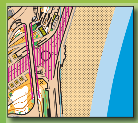
The Final races will pass over the valley footbridge. (For clarity the middle level has been removed.) Note the Passable and Impassable water on the beach!

Following Steve's first draft of courses it was apparent that two different alternatives were needed. Now this is